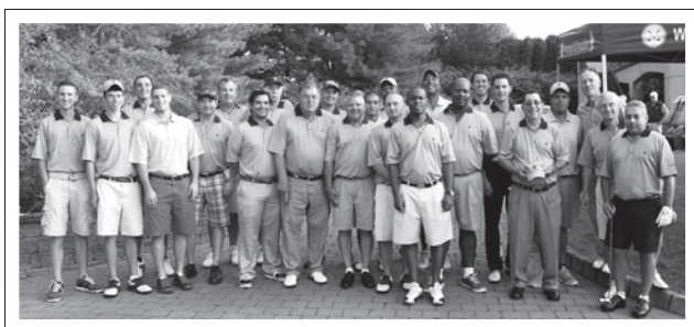
2012 Golf Marathon participants